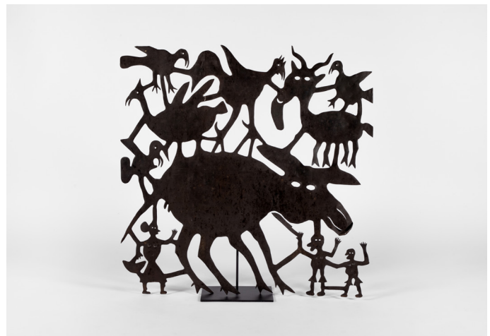
Georges LIAUTAUD, Untitled , 1960 Wrought iron, 81.28 x 86.36 cm