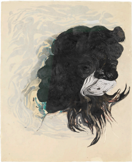
Ellen GALLAGHER, Morphia , 2008 Ink, pencil and watercolour on paper, 51,5 x 42,5 cm Londres, Hauser & Wirth