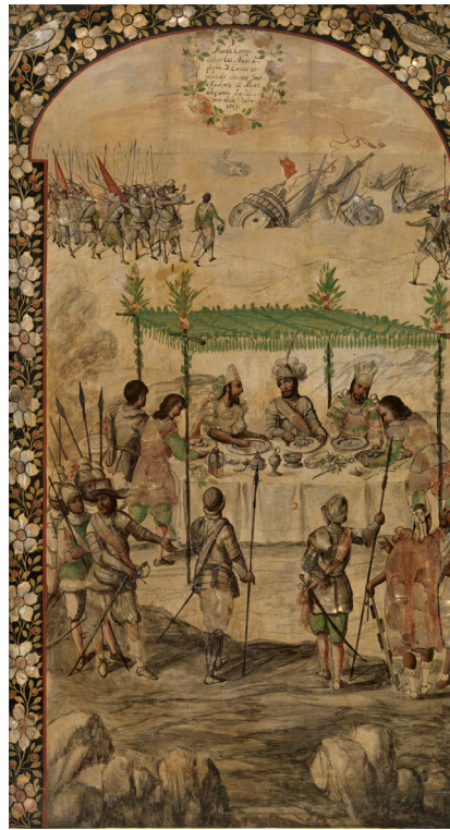
Juan et Miguel GONZÁLEZ, Conquista de México por Hernán Cortés (1 y 2) [Conquest of Mexico by Hernán Cortés (1 and 2)], 1698 Panel, canvas, oil paint, mother-of-pearl, 76,2 x 56,5 cm Madrid, Museo Nacional del Prado