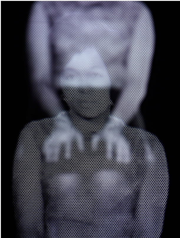
Aline MOTTA, A água e uma máquina do tempo #3 [Water is a time machine #3], 2023 Video installation. Collection of the artist