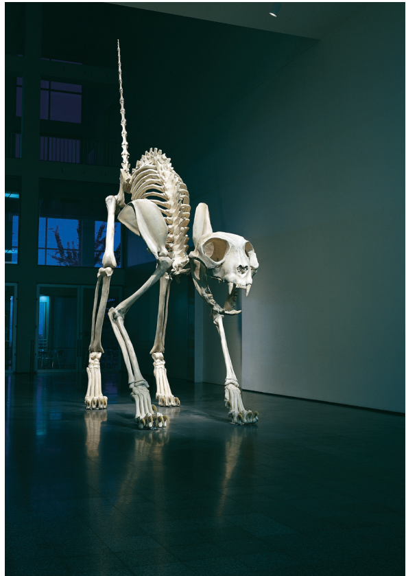
Maurizio Cattelan, Felix , 2001 Oil on polyvinyl resin, fibreglass and steel, 792 x 182 x 610 cm