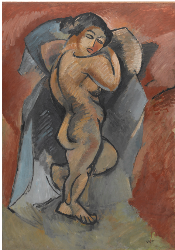
Georges Braque, Grand Nu, 1907-1908 Oil on canvas, 140 x 100 cm Centre Pompidou, Musée national d'art moderne, AM 2002-127