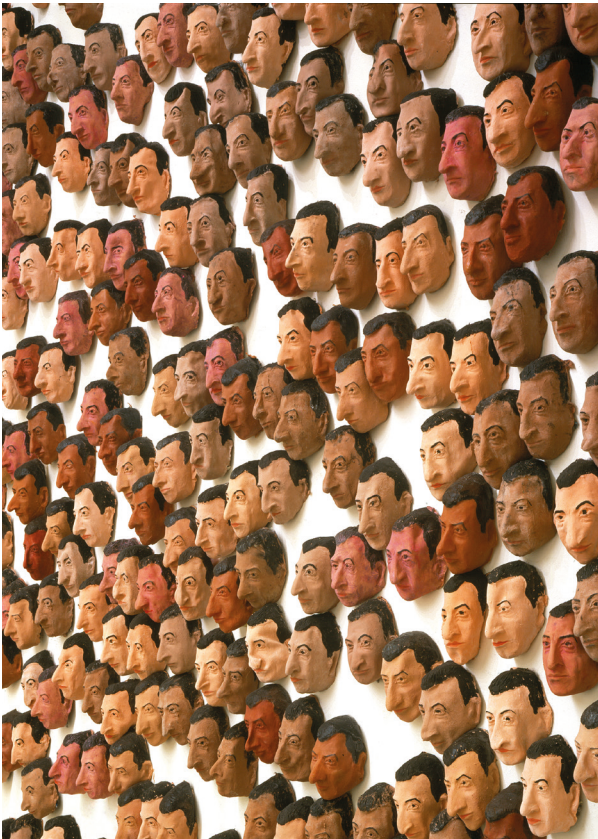
Maurizio Cattelan, Spermini , 1997 Painted latex masks, 17,5 x 9 x 10 cm (each) Courtesy Maurizio Cattelan's Archive Photo: © Attilio Maranzano