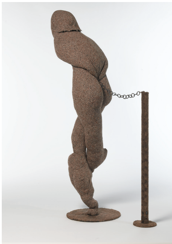
Dorothea Tanning, De quel amour , 1970 Fabric, metal, fur, 174 x 44,5 x 59 cm Centre Pompidou, Musée national d'art moderne, AM 1977-574 © The Estate of Dorothea Tanning / Adagp, Paris, 2025