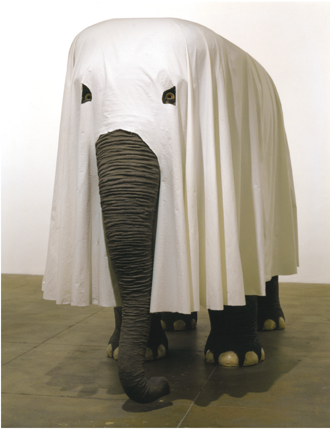
Maurizio Cattelan, Not Afraid of Love , 2000 Polyester styrene, resin, paint, fabric, 205 x 312 x 137 cm