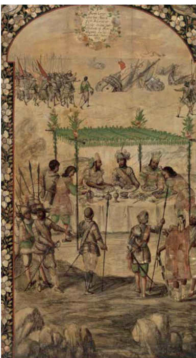
Juan et Miquel Gonzalez, Conquista de México por Hernán Cortés [Conquest of Mexico by Hernán Cortés], 1698 Panel, canvas, oil paint, mother-of-pearl, 76,2 × 56,5 cm Madrid, Museo Nacional del Prado

Neoliberal logics and capitalism have undoubtedly been marked by despair. This despair (or hopelessness) emerges from a dominant story that offered no alternatives to the system – Margaret Thatcher’s famous T.I.N.A. – but it is also the consequence of a critical thinking that, in its celebration of self-reflexivity, ends up reinforcing the epistemic and aesthetic confinement of Eurocentric modernity. However, when we are capable of envisaging the limits of modernity’s intelligibility, when we understand the colonial mindset, and when we recognise that there exists an epistemological, aesthetic and political exteriority, then hope becomes tangible again, and the possibility and necessity of abandoning linear time emerge in order to imagine other worlds beyond the end of time, of our time.