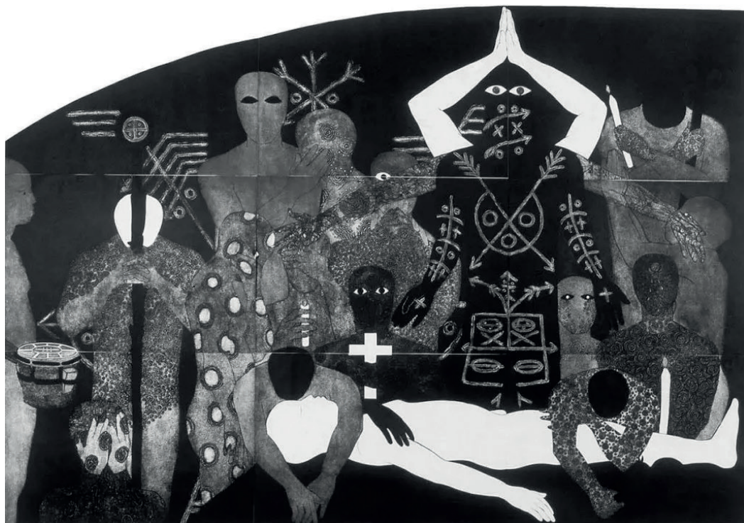
Belkis Ayón, Allora , 1991 Collography on thick paper, 215 x 300 cm. The Watch Hill Collection 2.09

In this sense, the epistemology of the diaspora runs counter to modern univocality and the apparent plurality of the contemporary artistic system. The diasporic artist must continually steer between multiple levels of meaning – which can include avant-garde or popular cultural elements – because he or she is addressing and interacting with different communities. This can be seen in the works of Belkis Ayón , Baya , Ahmed Cherkaoui , Wifredo Lam , Rubem Valentim and Frank Walter . Far from a form of appropriation, their references to spirituality and religions of African origin and to vernacular elements are combined with modernity without any of these worlds merging into each other. Thinking in terms of borderlands, which is an invitation to decentre oneself and to take a step back from the world of modernity